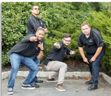
"Rekall Tech Team 2017"